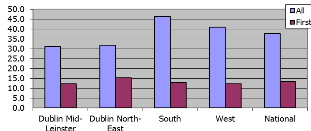
Figure 4 Health Service Executive Areas. All and first involuntary admissions. Ireland 2010. Rates per 100,000 total population

Involuntary admissions accounted for almost 9% of all and 9% of first admissions. The rate of involuntary all admissions was 40.9, the second-highest amongst all HSE areas, while that for first admissions was 12.1, the lowest amongst all HSE areas along with that in Dublin Mid-Leinster (Figure 4).