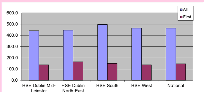
Figure 1 National and regional (HSE Areas) all and first admissions. Ireland 2010. Rates per 100,000 total population

Males accounted for 52% of all admissions, a rate of 480.5, the second-highest amongst all HSE areas for all admissions. The rate of first admissions for males in HSE West was 148.2.