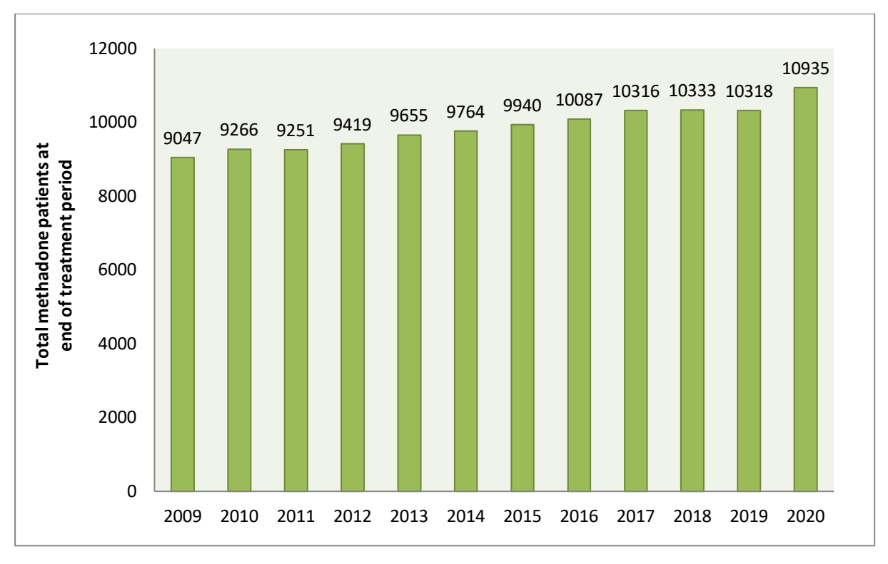
Figure 1: Number treated with methadone for problem opiate use