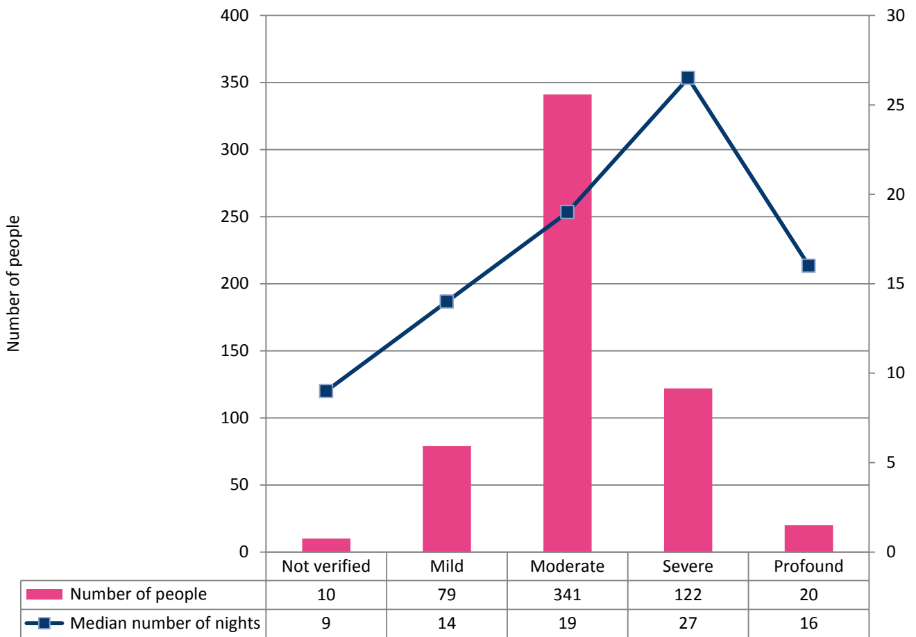
Figure 2 CHO Area 7: Number of people in receipt of respite nights and median number of respite nights provided, by level of intellectual disability, NIDD 2017