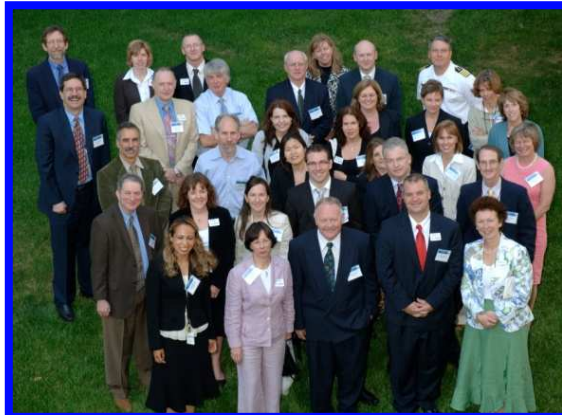
May 2007 OIA/NCI organizes the first All-Ireland Health Economics Workshop in Bethesda