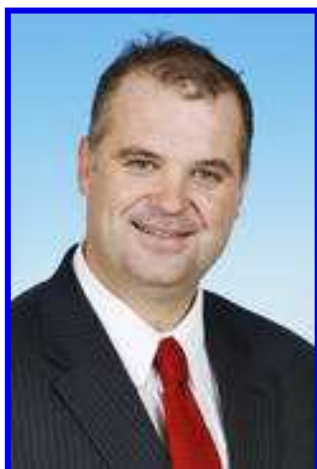
Dr. Tony Holohan Dep. CMO, Ireland