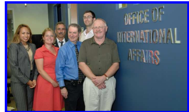
August 2008 First two HRB/NCI Health Economics Fellows begin their studies with the NCI Summer Curriculum in Cancer Prevention