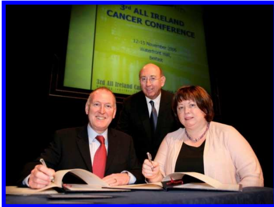
November 2006 Health Economics added to the MOU as an area of emphasis